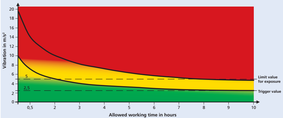
Limit values for vibration

The new reinforced grinding wheel WHISPER from PFERD significantly reduces vibration compared with conventional reinforced grinding wheels.